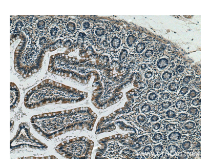
Immunohistochemical analysis of paraffinembedded human small intestine tissue slide using 10108-2-AP (CX3CL1 antibody) at dilution of 1:400 (under 10x lens)..