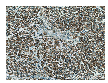
Immunohistochemical analysis of paraffinembedded human pancreas cancer tissue slide using 12007-1-AP (ERO1L antibody) at dilution of 1:200 (under 10x lens). Heat mediated antigen retrieval with Tris-EDTA buffer (pH 9.0).

mouse ovary tissue were subjected to SDS PAGE followed by western blot with 12007-1-AP (ERO1L antibody) at dilution of 1:100 incubated at room temperature for 1.5 hours.