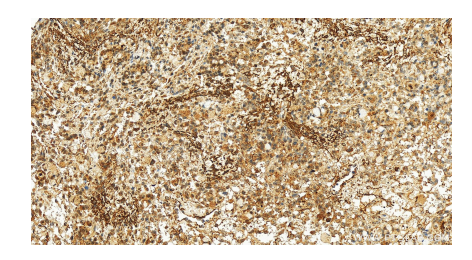
Immunohistochemical analysis of paraffinembedded human ovary cancer tissue slide using 12661-1-AP (COG8 antibody) at dilution of 1:200 (under 20x lens). Heat mediated antigen retrieval with Tris-EDTA buffer (pH 9.0).