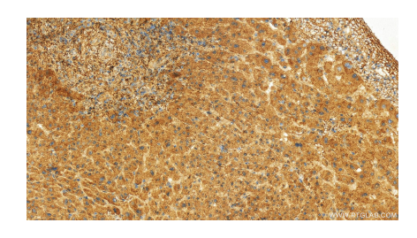
Immunohistochemical analysis of paraffinembedded human intrahepatic cholangiocarcinoma tissue slide using 13056-1-AP (LXN antibody) at dilution of 1:200 (under 20x lens). Heat mediated antigen retrieval with Tris-EDTA buffer (pH 9.0).