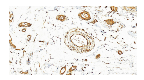
Immunohistochemical analysis of paraffinembedded human normal colon slide using 13727-1-AP (GRK3 antibody) at dilution of 1:600 (under 20x lens). Heat mediated antigen retrieval with Tris-EDTA buffer (pH 9.0).