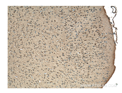
Immunohistochemical analysis of paraffinembedded mouse brain tissue slide using 13727-1-AP (GRK3 antibody) at dilution of 1:200 (under 10x lens. Heat mediated antigen retrieval with Tris-EDTA buffer (pH 9.0).