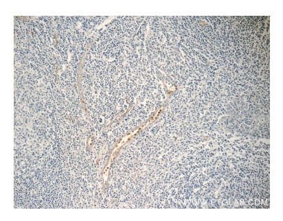
Immunohistochemical analysis of paraffinembedded human tonsillitis tissue slide using 14310-1-AP (NFAM1 Antibody) at dilution of 1:50 (under 10x lens).