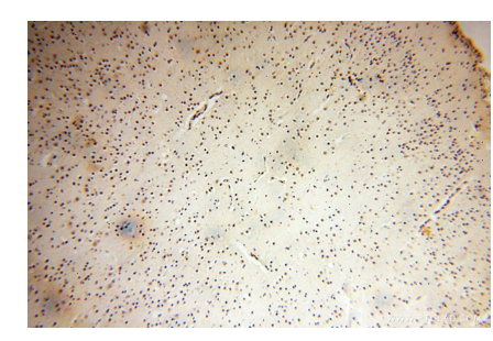
Immunohistochemical analysis of paraffinembedded human brain using 14574-1-AP (DEDD2 antibody) at dilution of 1:100 (under 10x lens).

HEK-293 cells were subjected to SDS PAGE followed by western blot with 14574-1-AP (DEDD2 antibody) at dilution of 1:300 incubated at room temperature for 1.5 hours.