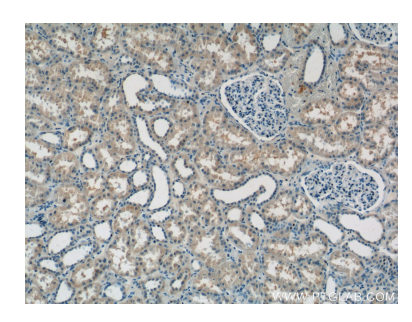
Immunohistochemical analysis of paraffinembedded human kidney tissue slide using 15305-1-AP (ATP6AP1 Antibody) at dilution of 1:50 (under 10x lens).

mouse kidney tissue were subjected to SDS PAGE followed by western blot with 15305-1-AP (ATP6AP1 antibody) at dilution of 1:300 incubated at room temperature for 1.5 hours.