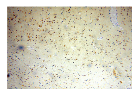
Immunohistochemical analysis of paraffinembedded human brain using 17070-1-AP (ZNF18 antibody) at dilution of 1:50 (under 10x lens).

Jurkat cells were subjected to SDS PAGE followed by western blot with 17070-1-AP (ZNF18 antibody) at dilution of 1:5000 incubated at room temperature for 1.5 hours.