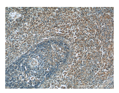
Immunohistochemical analysis of paraffinembedded human spleen tissue slide using 17321-1-AP (ERMP1 Antibody) at dilution of 1:50 (under 10x lens).