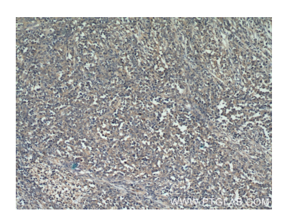
Immunohistochemical analysis of paraffinembedded human lymphoma using 18131-1-AP (FERMT3 antibody) at dilution of 1:50 (under 10x lens).