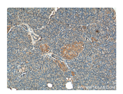
Immunohistochemical analysis of paraffinembedded human pancreas tissue slide using 18312-1-AP (ERO 1LB Antibody) at dilution of 1:200 (under 10x lens).

human brain tissue were subjected to SDS PAGE followed by western blot with 18312-1-AP (ERO1LB antibody) at dilution of 1:300 incubated at room temperature for 1.5 hours.