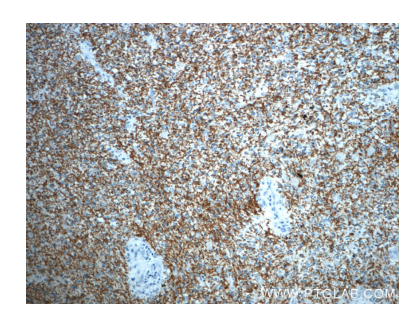
Immunohistochemical analysis of paraffinembedded human gliomas slide using 20220-1-AP (ROBO3-Specific Antibody) at dilution of 1:50.