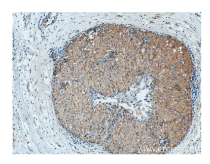
Immunohistochemical analysis of paraffinembedded human breast cancer tissue slide using 21556-1-AP (TUSC5 Antibody) at dilution of 1:200 (under 10x lens). Heat mediated antigen retrieval with Tris-EDTA buffer (pH 9.0).