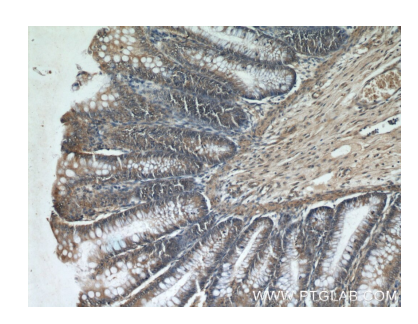
Immunohistochemical analysis of paraffinembedded human colon using 22041-1-AP (CCDC120 antibody) at dilution of 1:50 (under 10x lens).

Jurkat cells were subjected to SDS PAGE followed by western blot with 22041-1-AP (CCDC 120 antibody) at dilution of 1:500 incubated at room temperature for 1.5 hours.