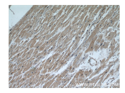
Immunohistochemical analysis of paraffinembedded human heart using 22274-1-AP (CALML6 antibody) at dilution of 1:50 (under 10x lens).

human heart tissue were subjected to SDS PAGE followed by western blot with 22274-1-AP (CALML6 antibody) at dilution of 1:500 incubated at room temperature for 1.5 hours.