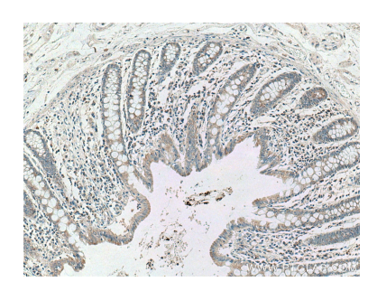
Immunohistochemical analysis of paraffinembedded human colon tissue slide using 22342-1-AP (CCL17 antibody) at dilution of 1:200 (under 10x lens. Heat mediated antigen retrieval with Tris-EDTA buffer (pH 9.0).