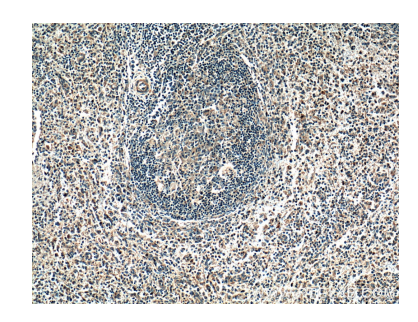
Immunohistochemical analysis of paraffinembedded human spleen tissue slide using 25350-1-AP (NOX5 Antibody) at dilution of 1:200 (under 10x lens).

Various lysates were subjected to SDS PAGE followed by western blot with 25350-1-AP (NOX5 antibody) at dilution of 1:500 incubated at room temperature for 1.5 hours.