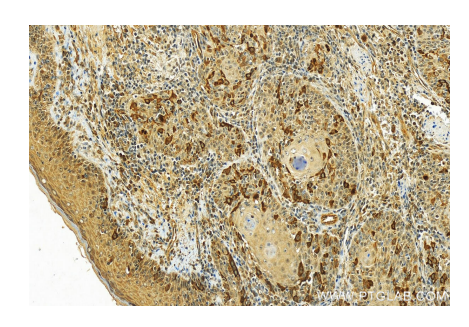
Immunohistochemical analysis of paraffinembedded skin cancer slide using 25486-1-AP (CKAP2 antibody) at dilution of 1:200 (under 20x lens). Heat mediated antigen retrieval with Tris-EDTA buffer (pH 9.0).