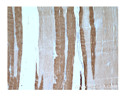
Immunohistochemical analysis of paraffinembedded human skeletal muscle using 55069-1-AP (MYH2 antibody) at dilution of 1:50 (under 10x lens).