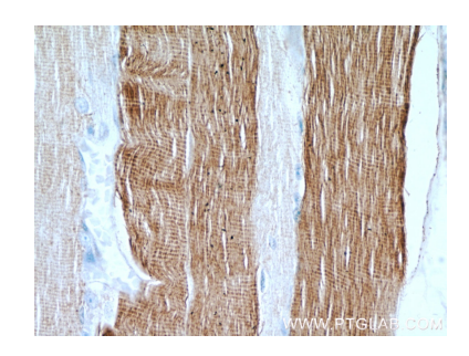
Immunohistochemical analysis of paraffinembedded human skeletal muscle using 55069-1-AP (MYH2 antibody) at dilution of 1:50 (under 40x lens).