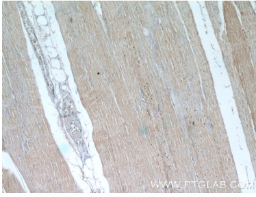
Immunohistochemical analysis of paraffin-embedded human skeletal muscle tissue slide using 55281-1-AP (OBSCN Antibody) at dilution of 1:50 (under 10x lens).