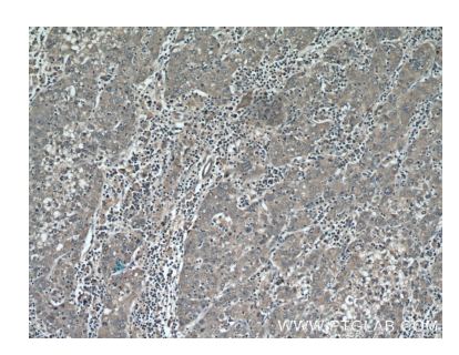
Immunohistochemical analysis of paraffinembedded human liver cancer using 55467-1-AP (MMP20 antibody) at dilution of 1:50 (under 10x lens).

mouse brain tissue were subjected to SDS PAGE followed by western blot with 55467-1-AP (MMP20 antibody) at dilution of 1:1000 incubated at room temperature for 1.5 hours.