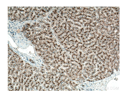
Immunohistochemical analysis of paraffinembedded human liver tissue slide using 27823-1-AP (LAMP2 antibody) at dilution of 1:200 (under 10x lens). Heat mediated antigen retrieval with Tris-EDTA buffer (pH 9.0).