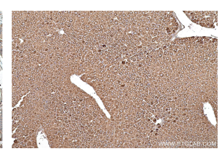
Immunohistochemical analysis of paraffinembedded mouse liver tissue slide using KHC0824 (DPYD IHC Kit).