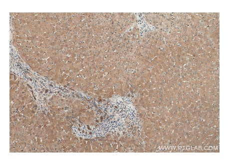
Immunohistochemical analysis of paraffinembedded human liver tissue slide using KHC0824 (DPYD IHC Kit).