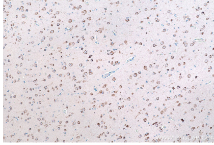
Immunohistochemical analysis of paraffinembedded human gliomas tissue slide using KHC0862 (RCN2 IHC Kit).