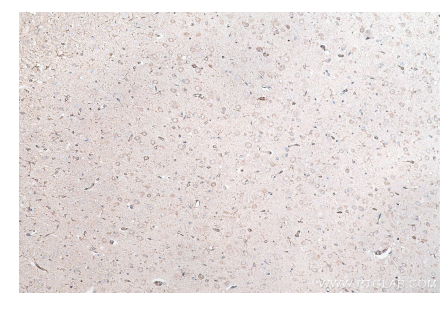
Immunohistochemical analysis of paraffinembedded rat brain tissue slide using KHC0862 (RCN2 IHC Kit).