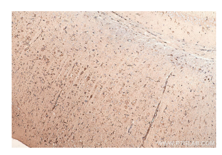
Immunohistochemical analysis of paraffinembedded mouse brain tissue slide using KHC0862 (RCN2 IHC Kit).