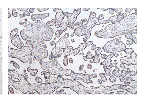
Immunohistochemical analysis of paraffinembedded human placenta tissue slide using KHC0862 (RCN2 IHC Kit).