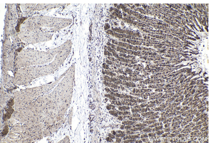
Immunohistochemical analysis of paraffinembedded rat stomach tissue slide using KHC0977 (SNRPB IHC Kit).