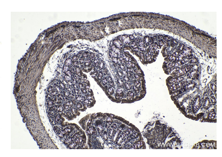
Immunohistochemical analysis of paraffinembedded mouse colon tissue slide using KHC0977 (SNRPB IHC Kit).