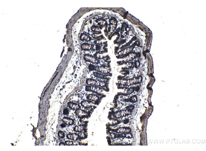
Immunohistochemical analysis of paraffinembedded rat colon tissue slide using KHC0977 (SNRPB IHC Kit).