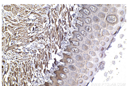
Immunohistochemical analysis of paraffinembedded rat tongue tissue slide using KHC1000 (ACYP2 IHC Kit).