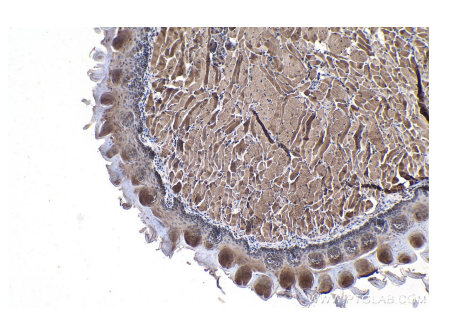
Immunohistochemical analysis of paraffinembedded mouse tongue tissue slide using KHC1000 (ACYP2 IHC Kit).