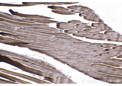
Immunohistochemical analysis of paraffinembedded rat skeletal muscle tissue slide using KHC1000 (ACYP2 IHC Kit).