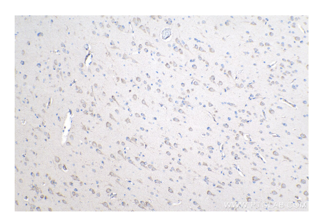
Immunohistochemical analysis of paraffinembedded human gliomas tissue slide using KHC1039 (ARPP19 IHC Kit).