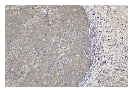
Immunohistochemical analysis of paraffinembedded human ovary tumor tissue slide using KHC1062 (NOTCH2 IHC Kit).