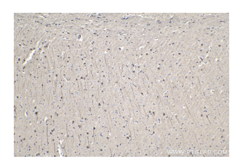
Immunohistochemical analysis of paraffinembedded mouse brain tissue slide using KHC1062 (NOTCH2 IHC Kit).