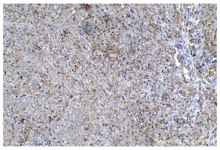
Immunohistochemical analysis of paraffinembedded human lymphoma tissue slide using KHC1080 (ASC/TMS1 IHC Kit).