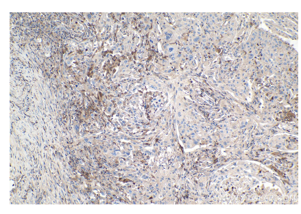
Immunohistochemical analysis of paraffinembedded human lung cancer tissue slide using KHC1080 (ASC/TMS1 IHC Kit).