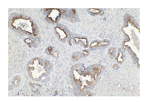
Immunohistochemical analysis of paraffinembedded human pancreas cancer tissue slide using KHC1105 (SPINK1 IHC Kit).