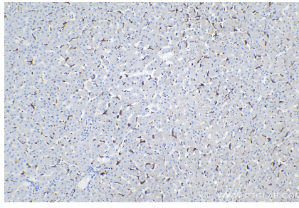
Immunohistochemical analysis of paraffinembedded human liver tissue slide using KHC1138 (MSR1 IHC Kit).