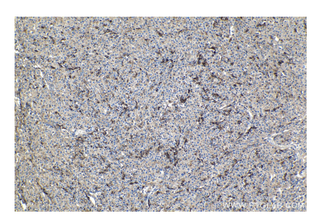
Immunohistochemical analysis of paraffinembedded human cervical cancer tissue slide using KHC1191 (PRNP IHC Kit).