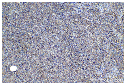
Immunohistochemical analysis of paraffinembedded human lymphoma tissue slide using KHC1195 (DEF6 IHC Kit).