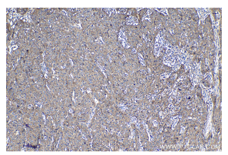
Immunohistochemical analysis of paraffinembedded human cervical cancer tissue slide using KHC1239 (PVR IHC Kit).