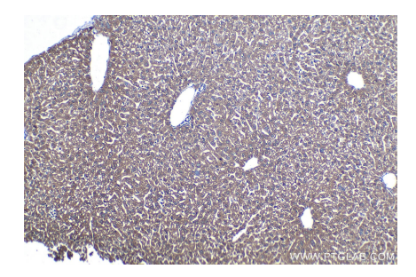
Immunohistochemical analysis of paraffinembedded human stomach cancer tissue slide using KHC1254 (PON2 IHC Kit).

Immunohistochemical analysis of paraffinembedded mouse liver tissue slide using KHC1254 (PON2 IHC Kit).