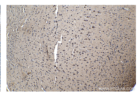
Immunohistochemical analysis of paraffinembedded mouse brain tissue slide using KHC1284 (LRCH1 IHC Kit).