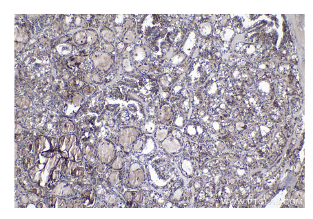
Immunohistochemical analysis of paraffinembedded human thyroid cancer tissue slide using KHC1350 (ALG3 IHC Kit).