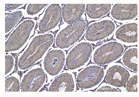
Immunohistochemical analysis of paraffinembedded rat testis tissue slide using KHC1364 (LMAN2 IHC Kit).