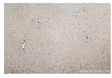
Immunohistochemical analysis of paraffinembedded mouse brain tissue slide using KHC1411 (BCKDHA IHC Kit).