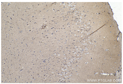
Immunohistochemical analysis of paraffinembedded rat brain tissue slide using KHC1411 (BCKDHA IHC Kit).