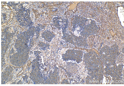
Immunohistochemical analysis of paraffinembedded human lung cancer tissue slide using KHC1420 (HIP1 IHC Kit).