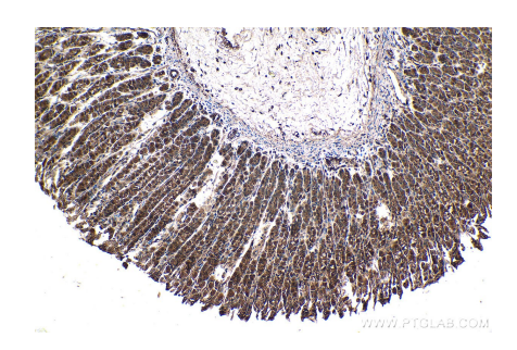
Immunohistochemical analysis of paraffinembedded rat stomach tissue slide using KHC1420 (HIP1 IHC Kit).