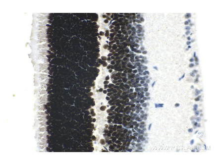
Immunohistochemical analysis of paraffinembedded mouse eye tissue slide using KHC1449 (CRX IHC Kit).