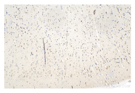
Immunohistochemical analysis of paraffinembedded mouse brain tissue slide using KHC1454 (RGS14 IHC Kit).