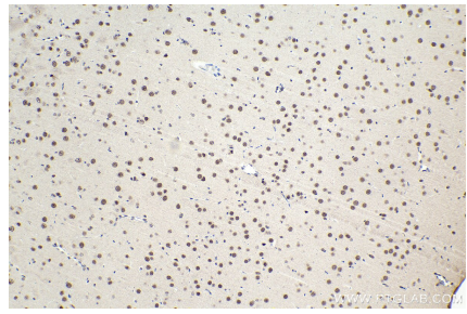
Immunohistochemical analysis of paraffinembedded rat brain tissue slide using KHC1579 (GTF2H1 IHC Kit).