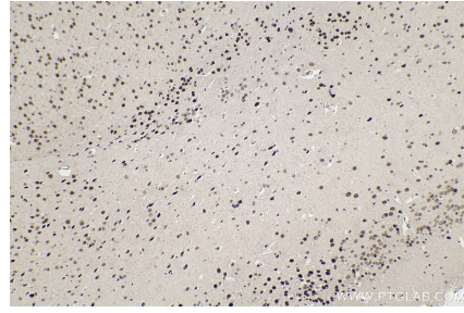
Immunohistochemical analysis of paraffinembedded mouse brain tissue slide using KHC1593 (PBX1 IHC Kit).