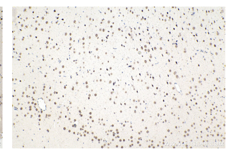
Immunohistochemical analysis of paraffinembedded rat brain tissue slide using KHC1593 (PBX1 IHC Kit).