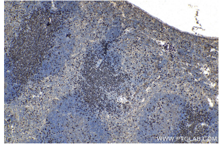
Immunohistochemical analysis of paraffinembedded mouse spleen tissue slide using KHC1599 (TCF7 IHC Kit).