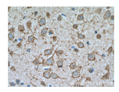
Immunohistochemical analysis of paraffinembedded mouse brain tissue slide using 19963-1-AP (KCNB1-Specific Antibody) at dilution of 1:200 (under 40x lens). Heat mediated antigen retrieval with Tris-EDTA buffer (pH 9.0).