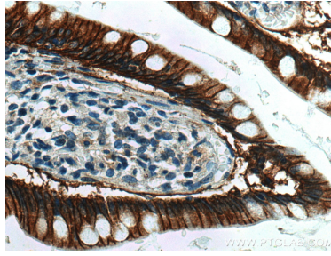
Immunohistochemical analysis of paraffin-embedded human small intestine tissue slide using 21248-1-AP (OSTbeta antibody) at dilution of 1:200 (under 40x lens).