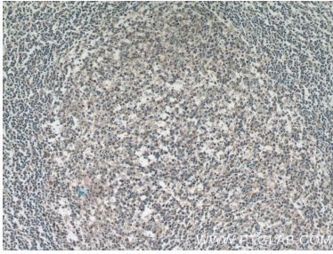
Immunohistochemical analysis of paraffin-embedded human tonsillitis tissue slide using 22303-1-AP (CCL18/MIP-4 antibody at dilution of 1:50 (under 10x lens).