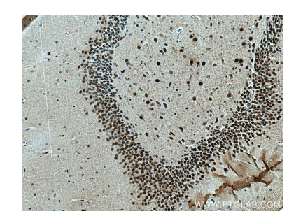
Immunohistochemical analysis of paraffinembedded rat brain tissue slide using 28819-1-AP (MEF2A antibody) at dilution of 1:200 (under 10x lens). Heat mediated antigen retrieval with Tris-EDTA buffer (pH 9.0).

Various lysates were subjected to SDS PAGE followed by western blot with 28819-1-AP (MEF2A antibody) at dilution of 1:1000 incubated at room temperature for 1.5 hours.